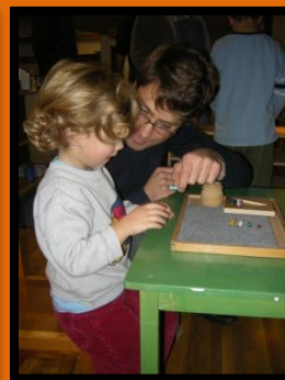
The Visit School

evening was also great fun. Watching the children show you our classrooms with such enthusiasm and pride gives us a thrill. It is so interesting to see what they choose to share or